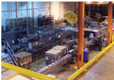
The new line — in reality.